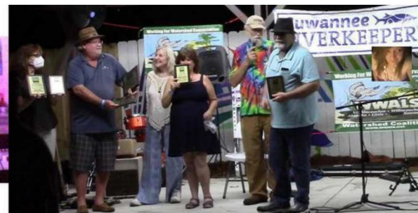
2020 winners: https://wwals.net/?p=53435