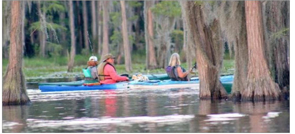
Above and at right are more scenes from the event at Banks Lake.