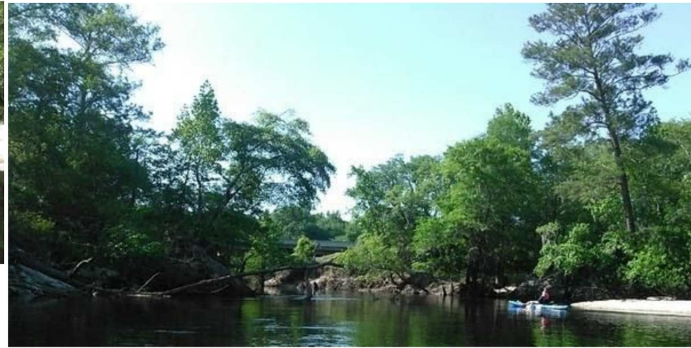
Naylor Beach, US 84 Bridge, 2016-05-07