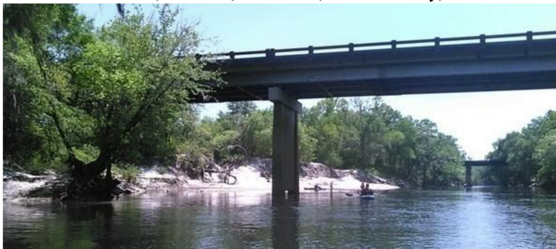
Howell Road Bridge and Mayday Landing, 2016-05-07

11.25 miles, 5.5 hours: left bank, Mayday Landing @ Howell Road , 749 Howell Road, Stockton, GA 31649, Echols County, GA.