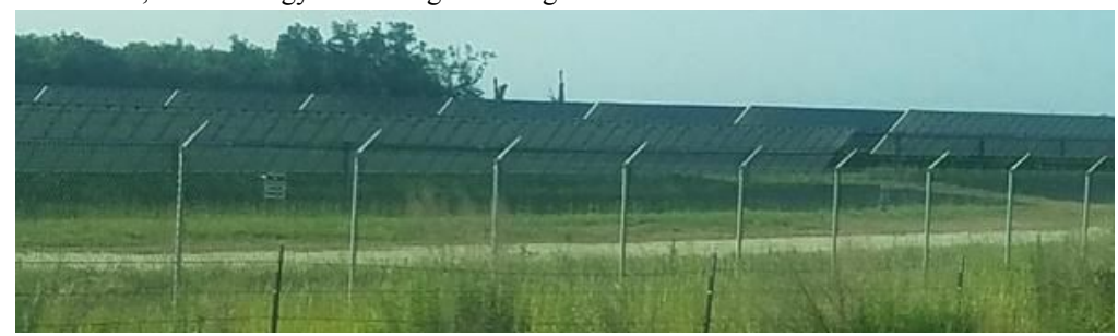
of Duke Energy Hamilton Solar Farm, Hamilton County, Florida.

Meanwhile, Duke Energy is building 74.9 megawatt solar farms in Florida. 16