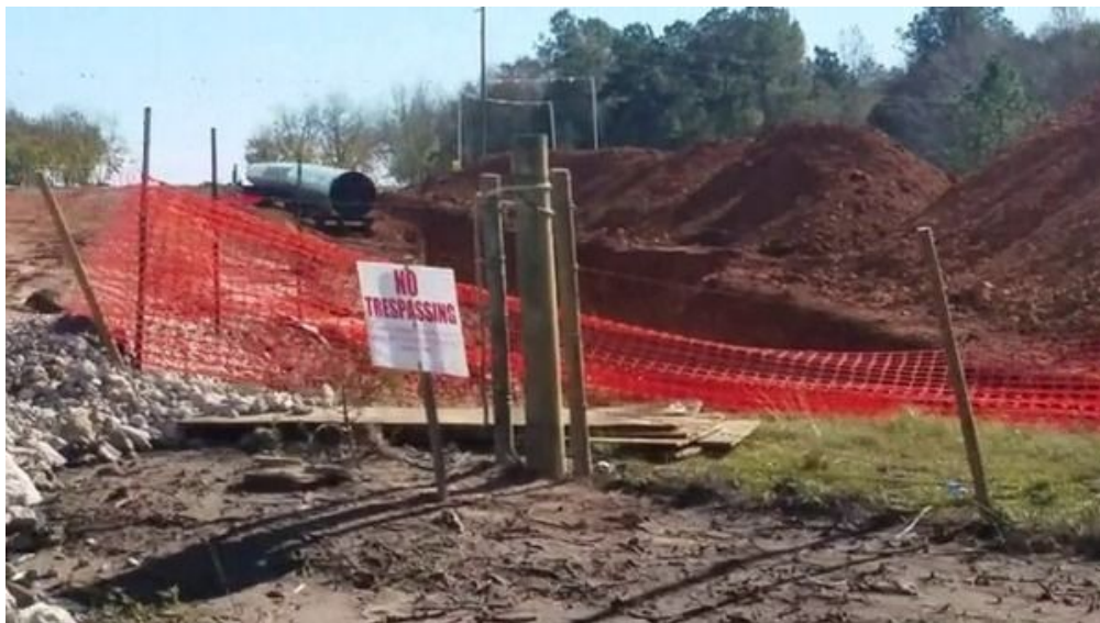
Inadequate silt fence south of Coffee Road, Brooks County, Georgia Picture by John S. Quarterman for WWALS 6 December 2016

There is silt fence at the road crossings of GA 333 and Coffee Road, but that fence does not continue onwards from the road. There is also no visible silt fence where the pipe is in the wetlands north of Coffee Road. I took these pictures Tuesday December 6th 2016.