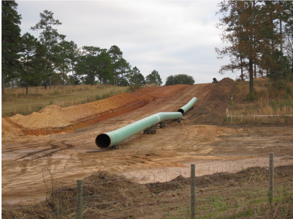
No silt fence at GA 122 Sabal Trail construction site; picture for WWALS 2016-12-07

I also have a report from yesterday, Wednesday December 7th 2016 that there is no silt fence at the Sabal Trail GA 122 crossing, and obviously muddied wetlands at that site. I have included two pictures below.