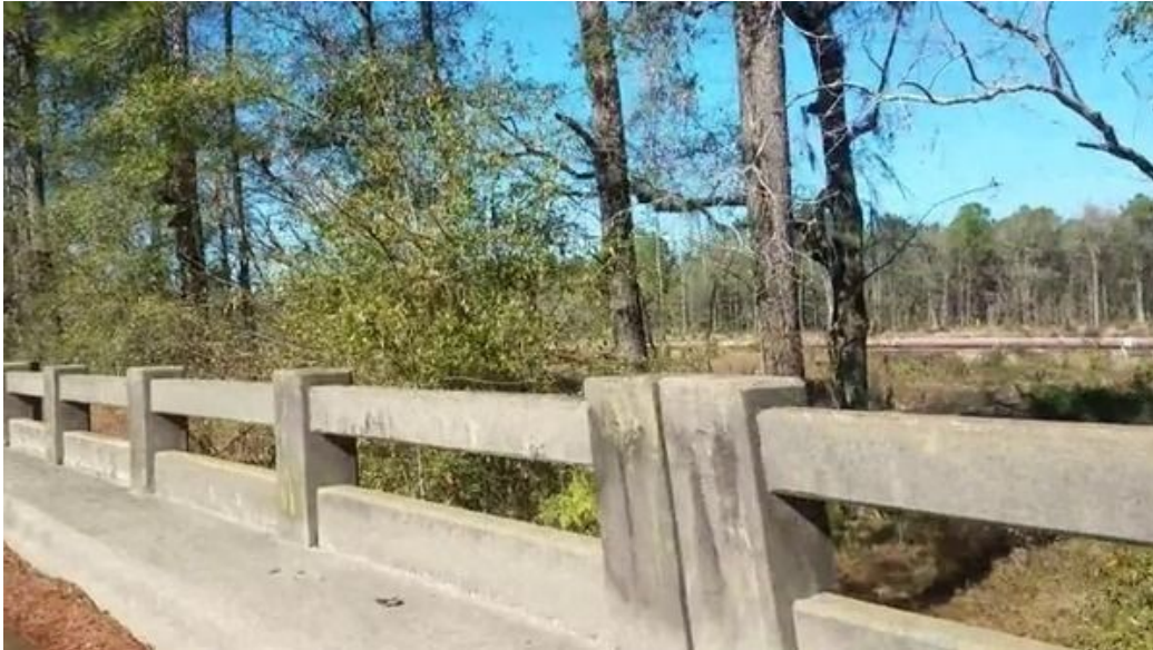
Looking north from Coffee Road, middle bridge between Okapilco Creek and Little Creek Picture by John S. Quarterman for WWALS 6 December 2016

Please see these pictures, which show no silt fence where Sabal Trail's pipe is laid out north of Coffee Road across Okapilco Creek and Little Creek in obvious wetlands. I've included one here, and there are more at this link: http://www.wwals.net/2016/12/08/sabal-trail-at-okapilco-creek-2016-12-06/