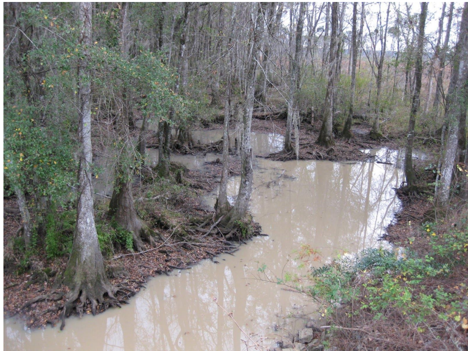
Damaged wetlands near Sabal Trail GA 122 construction site, Brooks County, GA 2016-12-07